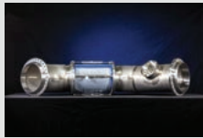
Flexible Metal Hose Assembly