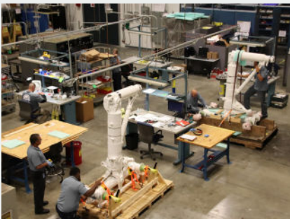
LANDING GEAR, WHEELS & BRAKES