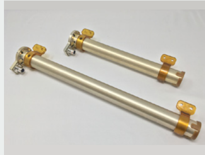
FUEL QUANTITY PROBE