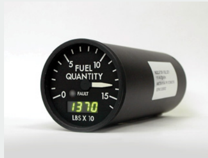
FUEL QUANTITY INDICATOR