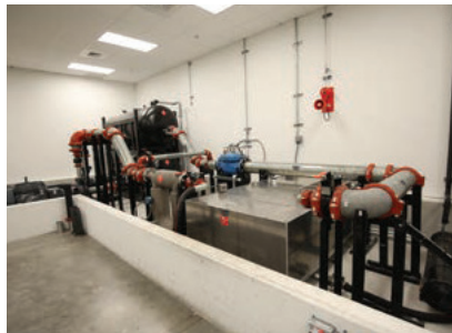
UNIVERSAL FUEL FLOW TEST STAND