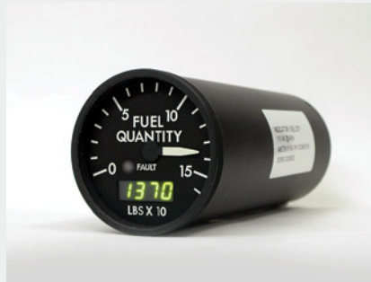
FUEL QUANTITY INDICATOR