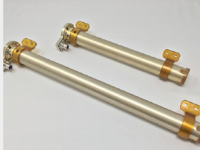
FUEL QUANTITY PROBE