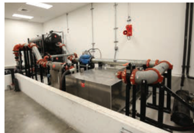
Universal Fuel Flow Test Stand