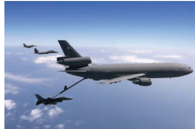
KC-10 refuels a joint-flight of F-15s and F-16s