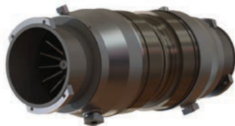
Fuel Flow Transmitter