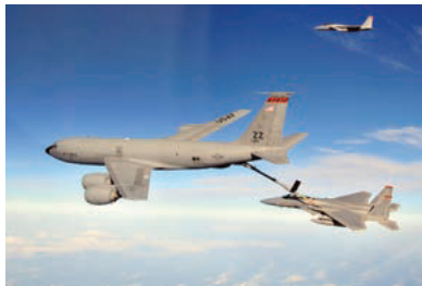
KC-135 refuels an F-15

The Fuel Flow Transmitter functions as the primary source of accurate fuel flow measurement during KC-135 and KC-10 in-flight refueling activities.