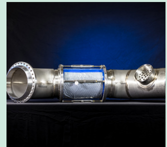
FLEXIBLE METAL HOSE ASSEMBLY