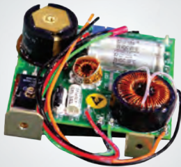
CIRCUIT CARD ASSY, ANTI-COLLISION LIGHT NSN: 5998-01-553-4705 P/N: 61-4116-1 HONEYWELL (GRIMES) (CAGE 72914)