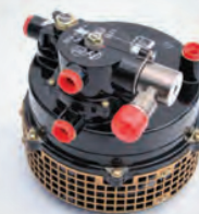
CABIN PRESSURE PRIMARY OUTFLOW VALVE NSN: 4820-01-312-1674 P/N: 103696-1 HONEYWELL (CAGE 64547)