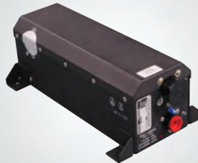
CASA CONTROLLER NSN: 1660-01-484-0253 P/N: 2119924-1 HONEYWELL (CAGE 64547)