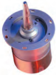
TRANSMITTER, AOA NSN: 6610-01-492-9888 P/N: SLZ8122 AEROSONIC (CAGE 98810)