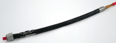
DRIVE ASSY-FLEXIBLE DOWN (FLEX SHAFT) NSN: N/A P/N: 10782 CEF (CAGE 00268)