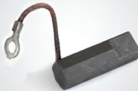
BRUSH, ELECTRICAL CONTACT NSN: 5977-01-494-8646 P/N: 775688-2 COLLINS AEROSPACE (CAGE 73030)