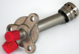
FUEL INJECTION NOZZLE NSN: N/A P/N: 3107126-1 HONEYWELL (CAGE 99193)