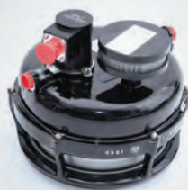
SECONDARY OUTFLOW VALVE NSN: 4820-01-312-1675 P/N: 103698-1 HONEYWELL (CAGE 64547)