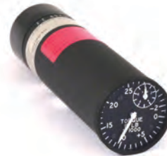
TORQUEMETER INDICATOR FOR C-130