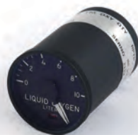
IND LOX FOR F-15