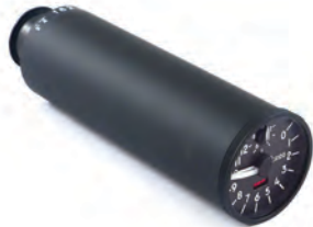
IND TEMP EHU-15A/A FOR C-130

AllClear is the exclusive stocking distributor for the Transicoil display modules product line.