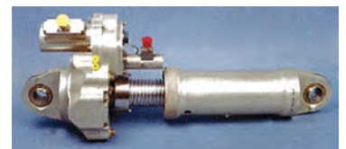
FLAP & HORIZONTAL STABILIZER ACTUATION SYSTEMS