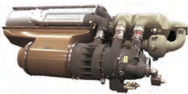
AIR CONDITIONING SYSTEMS