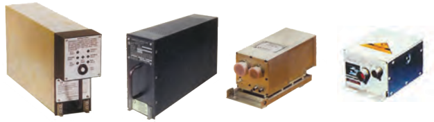
GENERATOR CONTROL UNITS