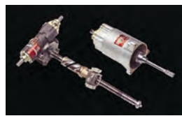
SLAT/FLAP ACTUATION & CONTROL SYSTEMS