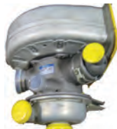
AIR CYCLE MACHINE