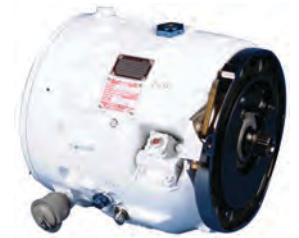
CONSTANT SPEED DRIVE (CSD)